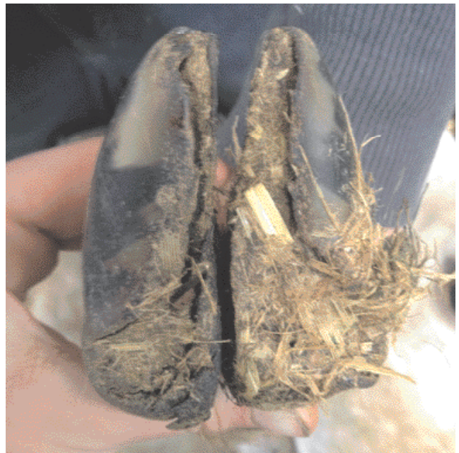
Figure 8: This photo indicates how quickly hooves will become overgrown. Only six weeks before this photo was taken, this foot had been carefully trimmed.