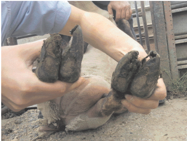
Figure 5: July 4, 2014.