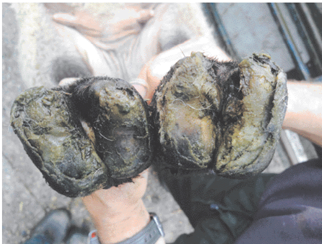
Figure 7: September 15, 2014.

case, cautious trimming, well clear of any sensitive tissue, will probably not cause further harm though it could be considered as a 'cosmetic' trim, not necessarily beneficial.