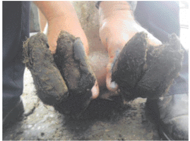
Figure 6: August 1, 2014.