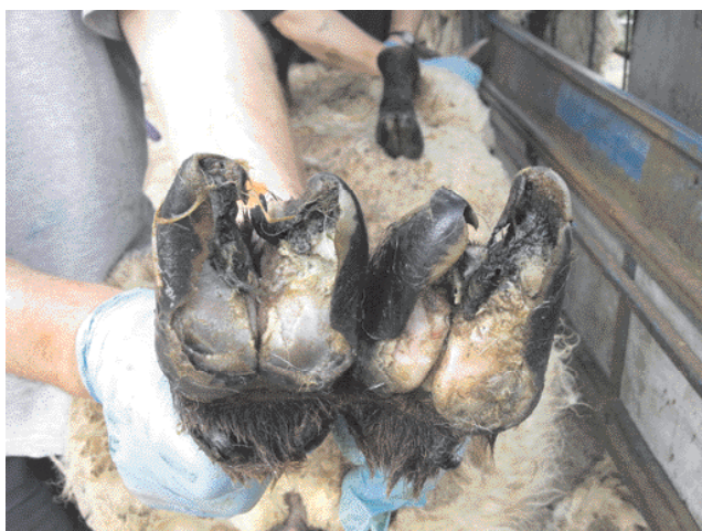
Figure 3: May 16, 2014.

with injectable and topical oxytetracycline but not trimmed. On June 6 (Figure 4) she was walking much better; she was not trimmed and no further treatment was given. On July 4 (Figure 5), August 1 (Figure 6) and September 15 (Figure 7), she was completely sound and her hooves developed back to a good shape despite no trimming at any stage. This ewe was at grass all summer and had not walked on hard surfaces. Trimming sheep feet does not necessarily keep them tidy as healthy sheep hooves can grow a couple of inches in a year – and perhaps even more when there has been