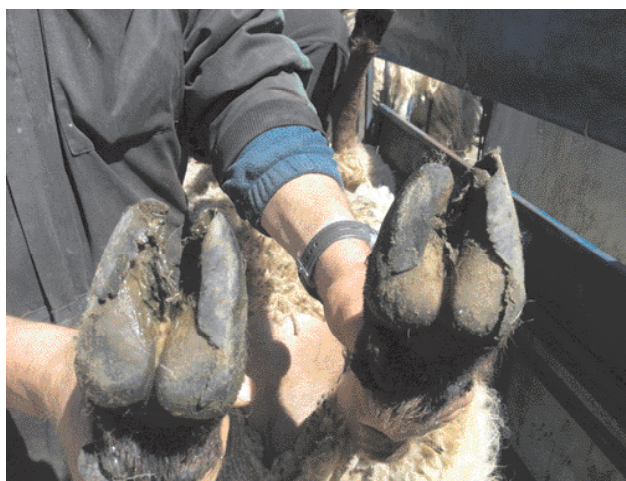
Figure 4: June 6, 2014.

with injectable and topical oxytetracycline but not trimmed. On June 6 (Figure 4) she was walking much better; she was not trimmed and no further treatment was given. On July 4 (Figure 5), August 1 (Figure 6) and September 15 (Figure 7), she was completely sound and her hooves developed back to a good shape despite no trimming at any stage. This ewe was at grass all summer and had not walked on hard surfaces. Trimming sheep feet does not necessarily keep them tidy as healthy sheep hooves can grow a couple of inches in a year – and perhaps even more when there has been